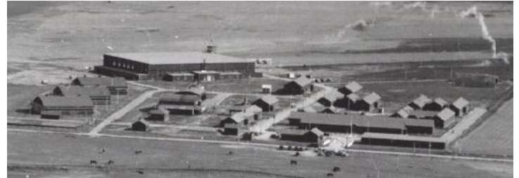
Single hangar and other buildings at No. 5 EFTS

Over 4000 pilots had been trained prior to the school closing in December, 1944. An amazing total of 254,603.5 hours had been flown at No. 5