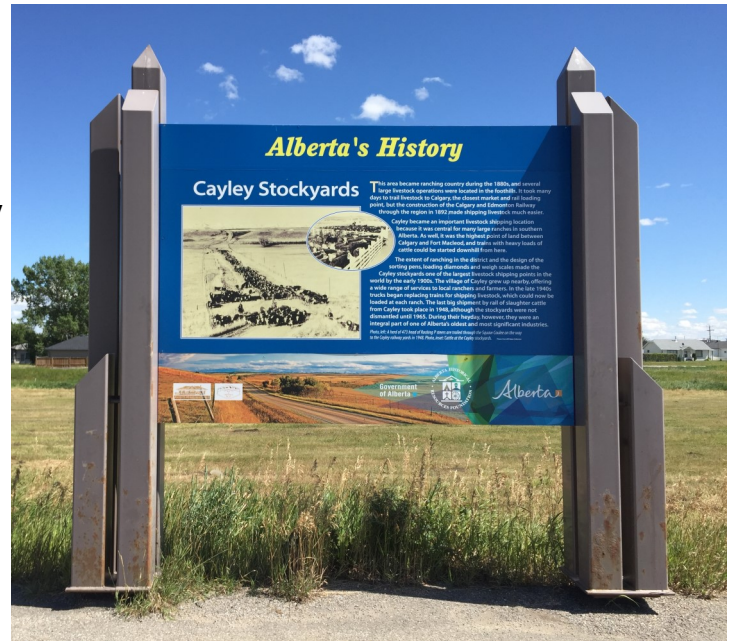
Similar signage at Cayley tells of the Cayley Stockyards

The Royal Canadian Legion (High River Branch), in association with the Bomber Command Museum of Canada, is proposing to enhance the site where the commemorative plaque is currently located by placing signage and a flag pole from which the Royal Canadian Air Force flag would be flown.