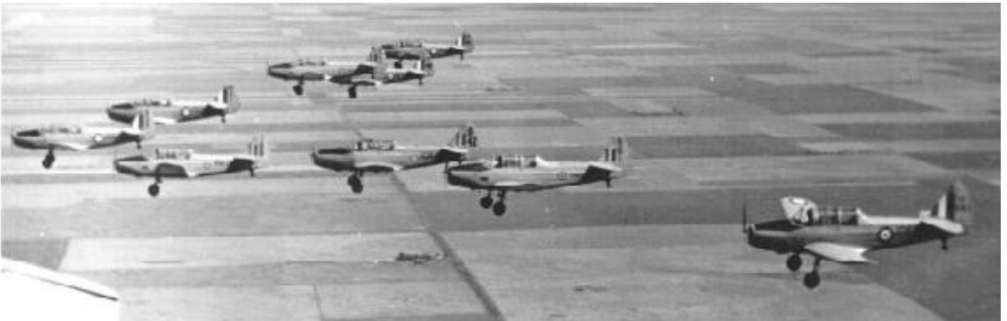
No. 5 EFTS Cornell aircraft in formation