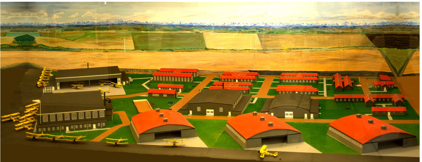
This photograph of a model of No. 5 EFTS will be incorporated into the signage.