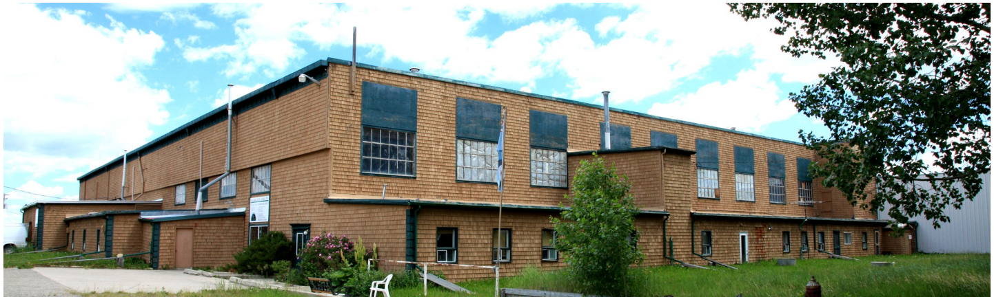
The original No. 5 EFTS hangar

During 2002, a commemorative plaque was placed on the roadside immediately north of the site, adjacent to the former entrance to the station. During the post-flood re-construction of this road, the plaque was moved to the eastern entrance to the former site of the airfield.