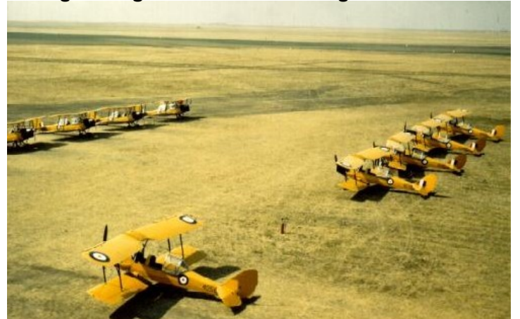
Initially the Tiger Moths flew off of the grass field