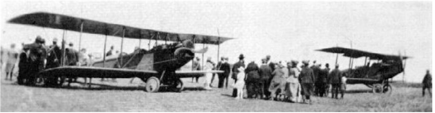
Visitors' Day at RCAF Station High River c.1924

RCAF Station High River was a major participant in the British Commonwealth Air Training Plan. This huge, largely Canadian effort included hundreds of schools across Canada. 131,553 aircrew were trained during WW II.