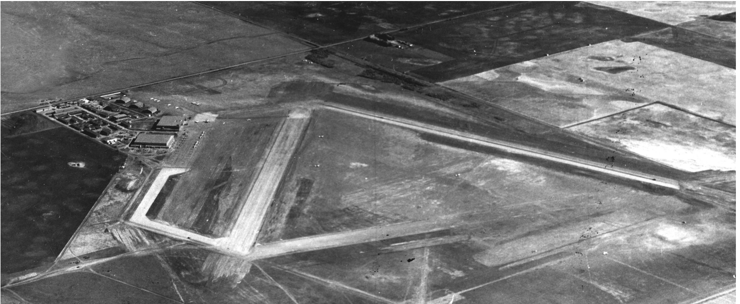
No. 5 EFTS following the construction of the second hangar and runways