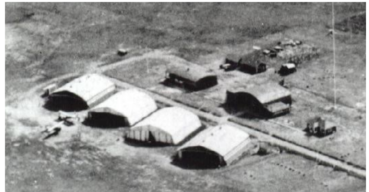
Bessoneau hangars and associated buildings

The station remained as an aircraft storage facility until the beginning of the Second World War.