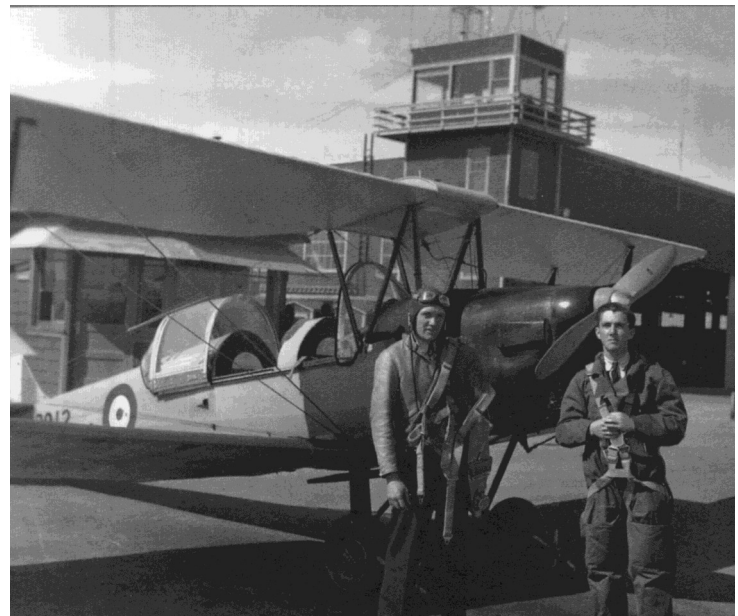
Student, instructor, and Tiger Moth at No. 5 EFTS